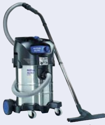
ATTIX 40-01 PC INOX shown

All NEW ATTIX vacuums include a PET filter which can be washed and is very hard wearing. To improve wet dirt collection the NEW range also features a 'fleece' filter bag. This NEW bag is more durable to wet dirt which means easier disposal.