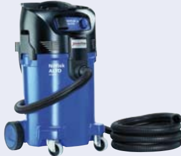
ATTIX 50-21 XC shown